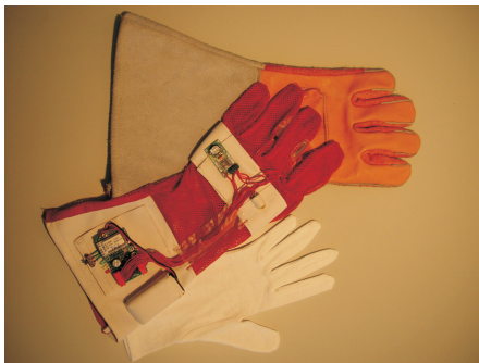
Fig. 1. Layer-based Wearing Concept of the Data-Glove

The wearing concept is based on three different gloves that build the actual data glove. By changing the outer glove the device can be adapted to specific application domains whereas the inner glove can be used for hygiene aspects. Figure 1 shows the data glove used in our experiments as well as its layer-based wearing concept.